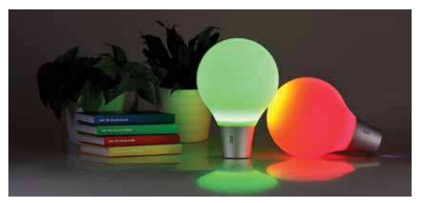
COLORUP by PEGA D&E | DMS COMPANY