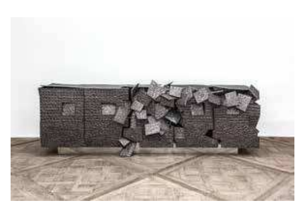
BHANGA ALU, BHANGA BRONZE by VINCENT DUBOURG