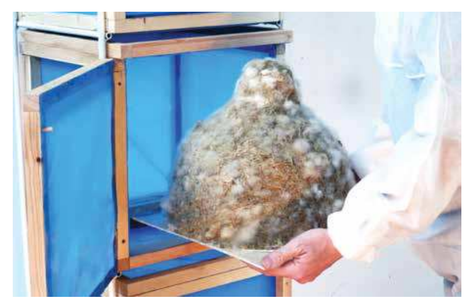
MYX LAMP by JONAS EDVARD